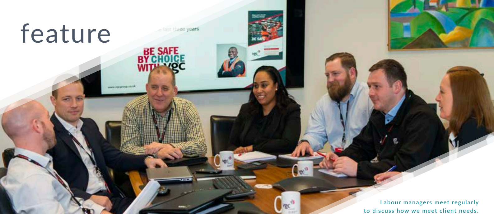
Labour managers meet regularly to discuss how we meet client needs.