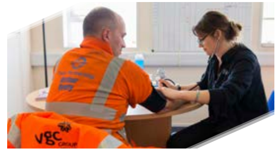
We funded a nurse who carried out free health checks at both the Track Partnership 'Boots on the Ground' events.

Our involvement with clients begins as early as possible. For example, on the new A14 Cambridge to Huntingdon upgrade project, we have been working from the very start of project set-up to see how we can support safety.