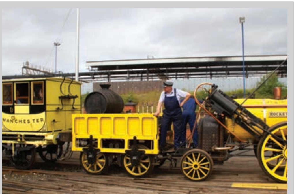
Stephenson's Rocket

The railway was built by George Stevenson and is noted, among other things, for having the first railway tunnel under a metropolis - the Wapping Tunnel in Liverpool, and the technically brilliant crossing of Chat Moss, an area of bog land considered impassable by many sceptics.